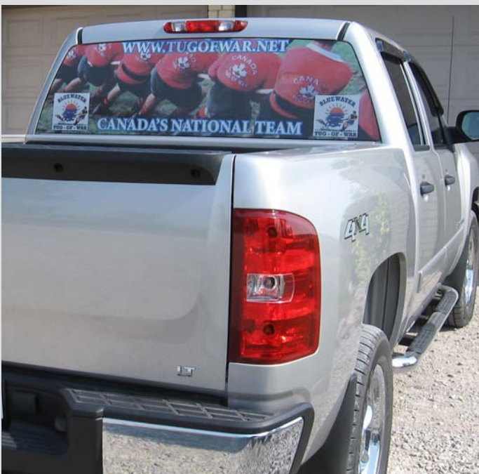
Matt Metzger's pick-up truck with its eye catching window sticker.

Although some team members of the Bluewater Tug of War Club do have their team's web address displayed on their vehicles in form of bumper stickers, our web site was only averaging 8 visitors per day.